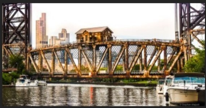
Chicago Bridge House STEVE MAJSAK - USA