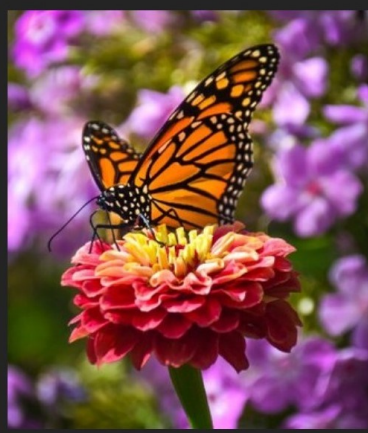
Monarch Migration STEVE MAJSAK - USA