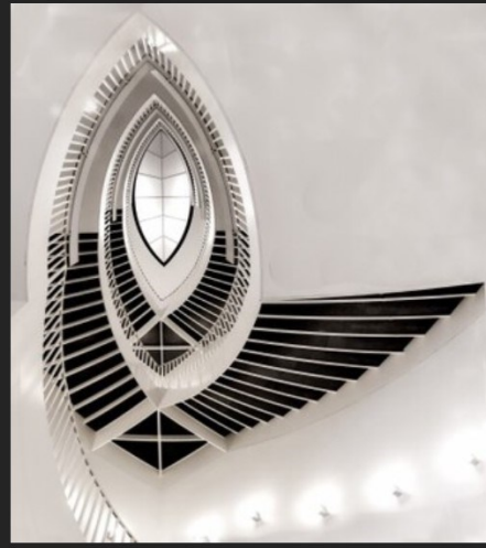
Honorable Mention Looking Up STEVE MAJSAK - USA