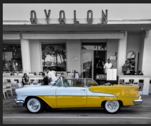
Back to the Future STEVE MAJSAK - USA