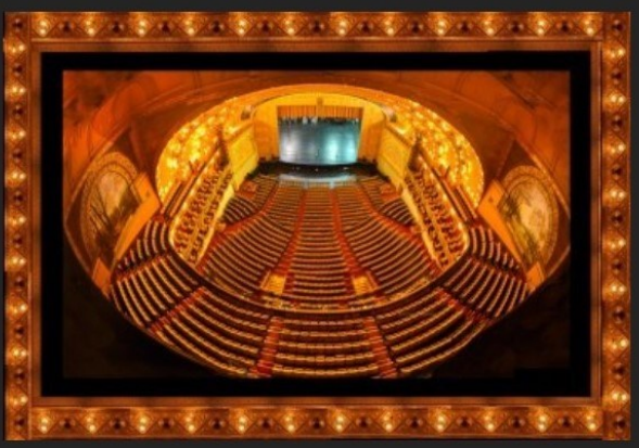
View from the Heavens STEVE MAJSAK - USA