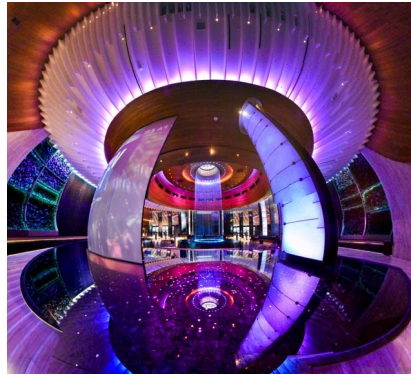
Transverse Spherical Lens - This is the one I selected.