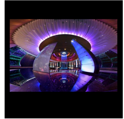
Transverse Cylindrical Lens

At this point, editing is up to you and there are an unlimited number of possibilities. I used the "spot removal" tool in Lightroom to copy and paste the colored section in the lower left of the photo to cover the lobby section visible at the lower right. I also used this tool to remove people that were visible in the photo.