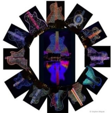
Step-by-step layering on individual images to create the final photograph

Placing images like the hands on a clock, I placed each photo to complete the circle, complementing colors and varieties of the images projected by the building. I returned to the full photo of the vibrant guitar reflected in the water below as the center image to fill the center of the clock. When all the photos were placed, I filled in the white space with black backgrounds to bring out the full variety of colors in the photo.